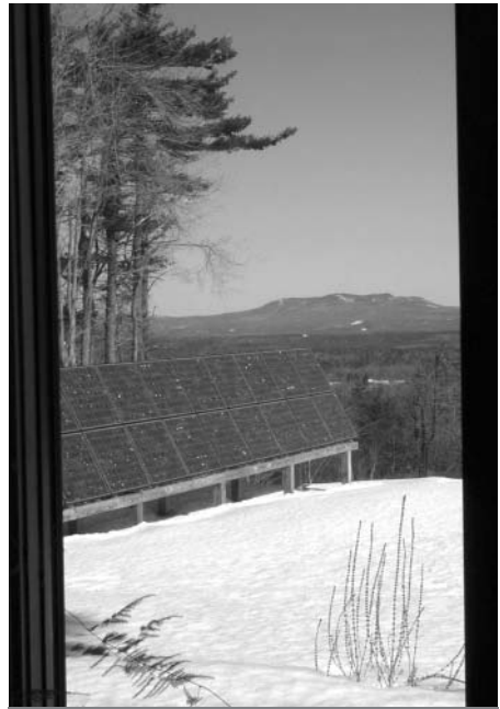
A home in the woods of New Hampshire had too much shade to use PV on the roof. The solution was installing a freestanding PV array.

It might not be. You generally get what you pay for, and it's possible that a low price could be a sign of inexperience. Companies that plan to stay in business must charge enough for their products and services to cover their costs, plus a fair profit margin. Therefore, price should not be the only consideration, and quality should probably rank high on the list.